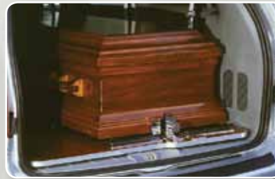
Oversized caskets and shipping containers easily fit into the rear compartment.