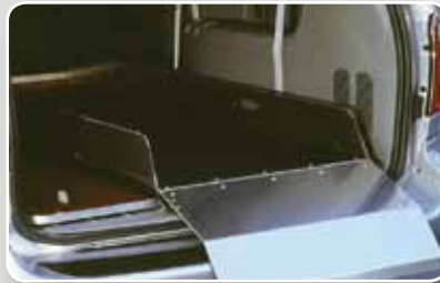
The standard aluminum cot mate is lightweight and features a flip-down ramp to facilitate loading and unloading.