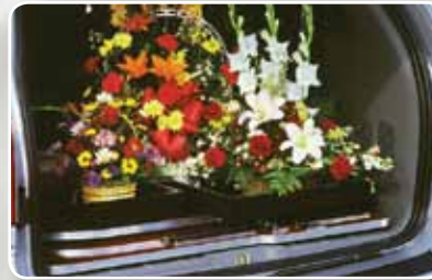
Two aluminum floral trays are accessible when the hinged casket floor is folded over.