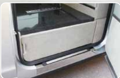
A closed church truck well provides floor space for floral arrangements and a clean, spacious appearance.