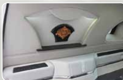
The interior landau trim panel features LED lighting, decorative materials and double-needle tailoring for an elegant and sophisticated look.